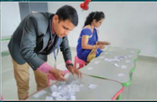
Confidentiality In COUNTING. most exciting moment....!!!