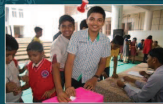
Huge Response for Voting...! "My Vote Matters"