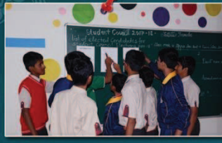
Declaring and displaying the Election Results