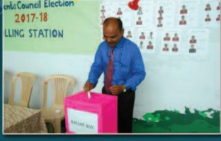
Participation of Teachers under the Guidance of Authorities.