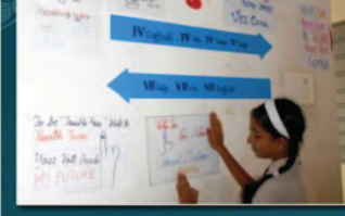
Campaigning of the candidates "Vote For Me"